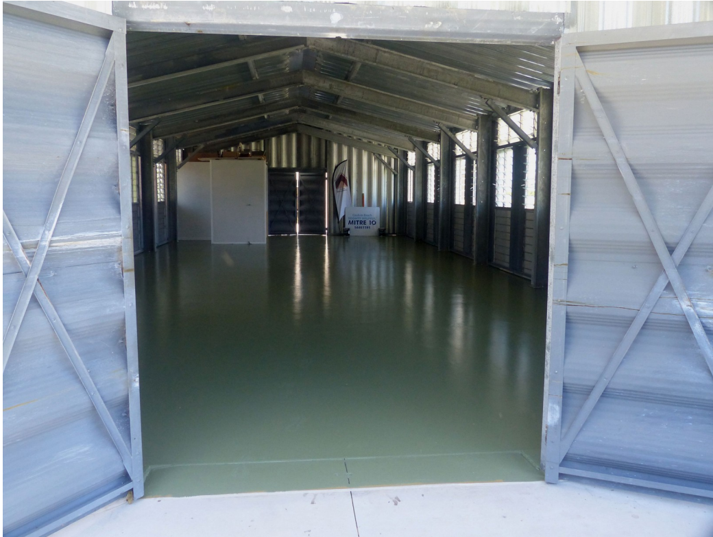
Yes, isn't it looking grand!

Some equipment has begun to appear in the shed. Our next major step is getting the electrical fit-out done. This will be at a significant cost as mentioned in the last Newsletter.