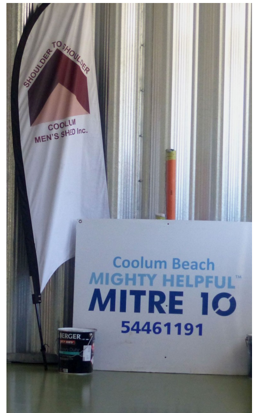
Thanks, Mitre 10 !!