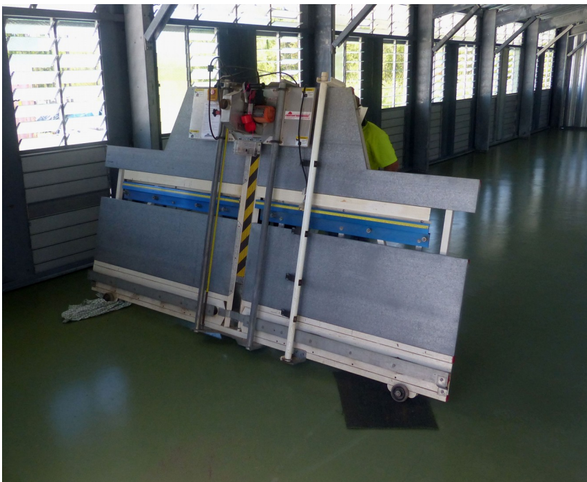
This was heavy !!!